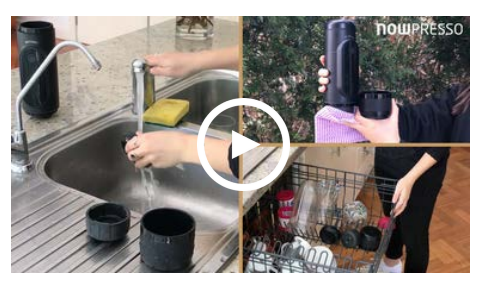
HOW TO Clean NowPresso Portable Espresso Machine