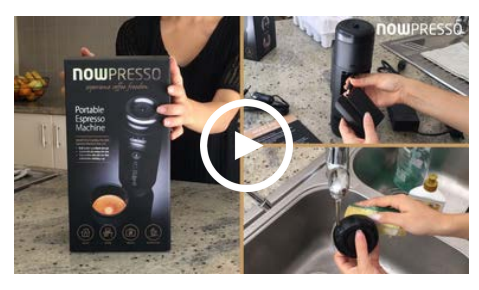
MUST DO for First Use