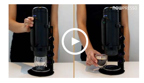
HOW TO use NowPresso Stand