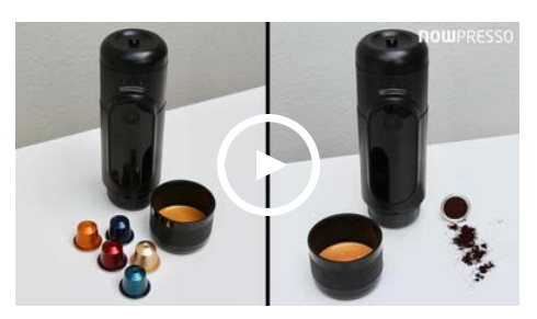
NowPresso Portable Espresso Machine