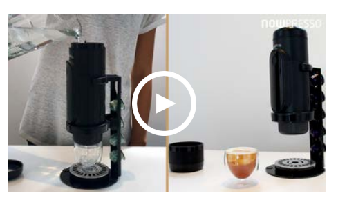
HOW TO make Iced Coffee