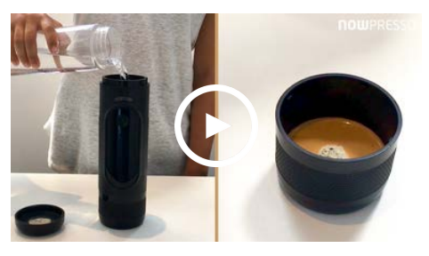
HOW TO boil water to make coffee