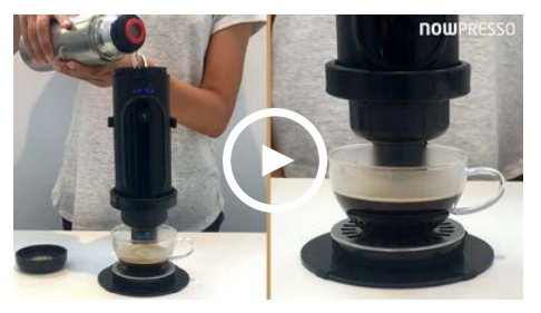
HOW TO make Lungo Espresso