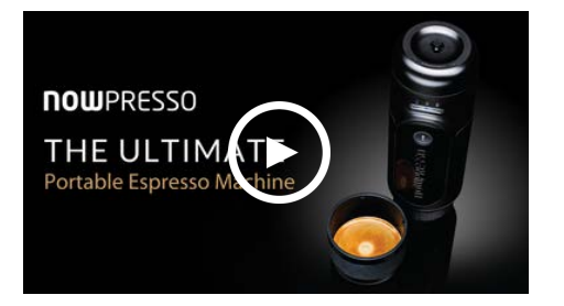
The Ultimate Portable Espresso Machine