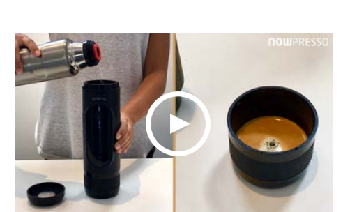
HOW TO instantly make coffee using boiled water