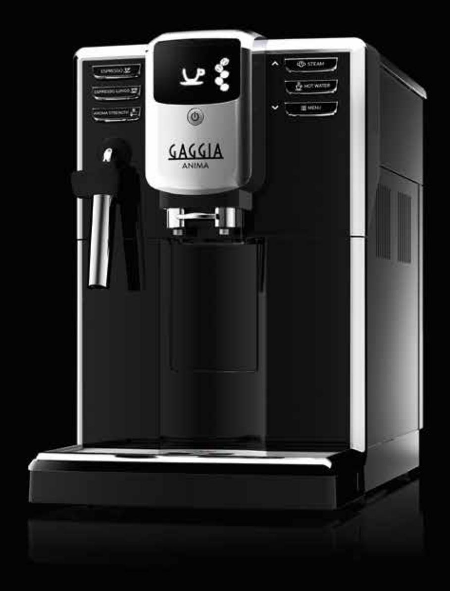
Black is back.

The most elegant color ever enriched by chromed metal painted details.