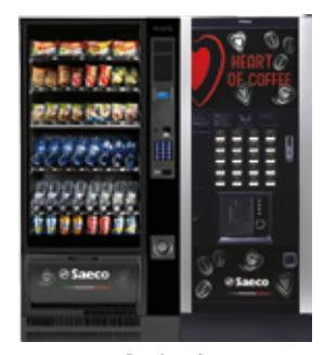
Artico L Atlante Evo 700