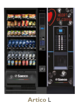
Cristallo Evo 600