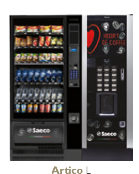
Atlante Evo 500